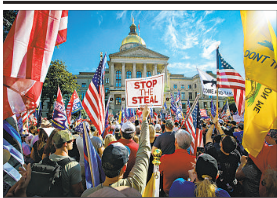
FAR-RIGHT election deniers have spread disinformation since former President Trump lost his reelection bid. Above, Trump supporters rally in Atlanta in 2020.

forced to walk away.” It’s been more than a week since police swarmed the UCLA campus and tore down the pro-Palestinian camp, arresting more than 200 people. But the legacy of the encampment remains an issue of much debate, particularly among Jewish students, who make up nearly 8% of the university’s 32,000 undergraduates. In the days leading up to April 30 — when pro-Israel counterprotesters attacked the camp with fists, bats and chemical spray, and police took hours to stop the violence — frustration had swelled among many Jews: Viral videos showed activists [See UCLA, A6]