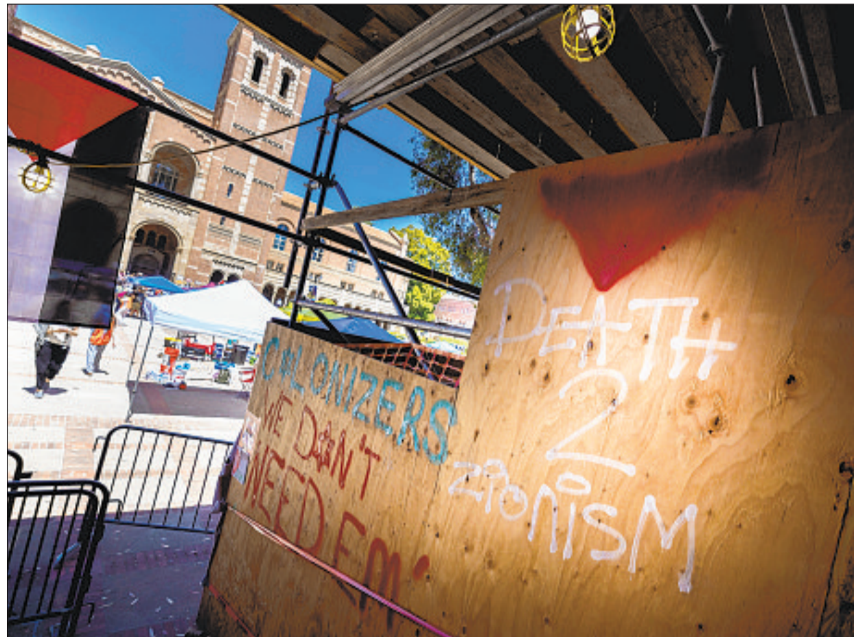
SOME JEWISH students at UCLA said they felt intimidated as protesters scrawled graffiti and blocked access on campus with barricades and human walls. Above, tagging near Powell Library on April 29.