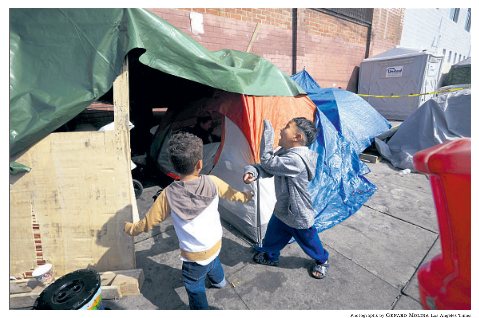
MIGRANT children play in front of tents they share along Towne Avenue on Skid Row. More than 200 children now live in the area.