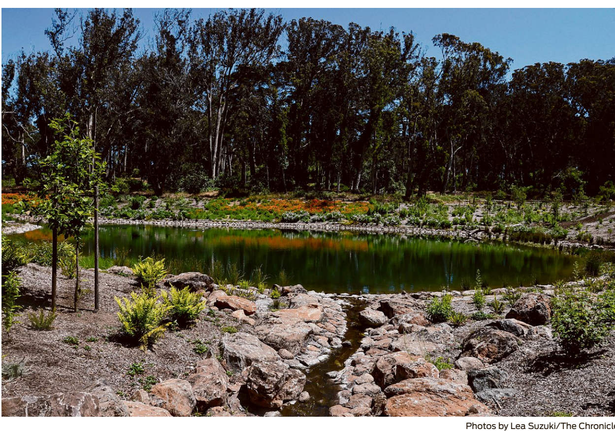
Golden Gate Park's Middle Lake, which has been dried up for years, is close to the end of its renovation and is being prepared for reopening. It is part of a three-lake chain that was dug out in 1899.