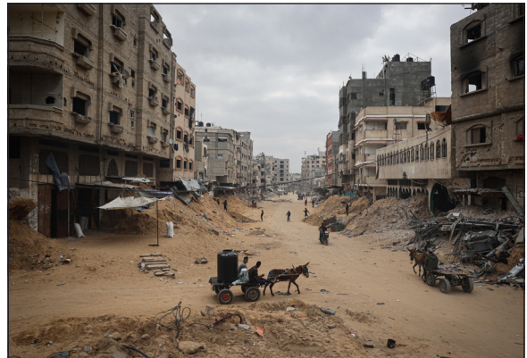
Palestinians walk between damaged buildings in Khan Yunis in the Gaza Strip on Thursday. Hamas has indicated a desire to continue truce talks.