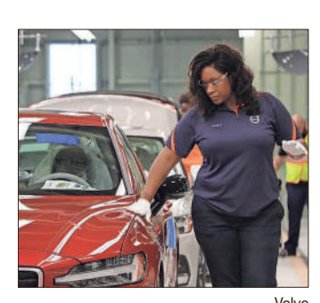
Volvo opened its plant in Ridgeville, S.C., in 2018.