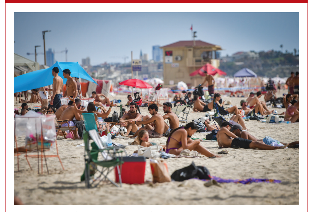
SUMMERTIME AND THE LIVING'S EASIER

Jerusalem Film Festival announces its opener