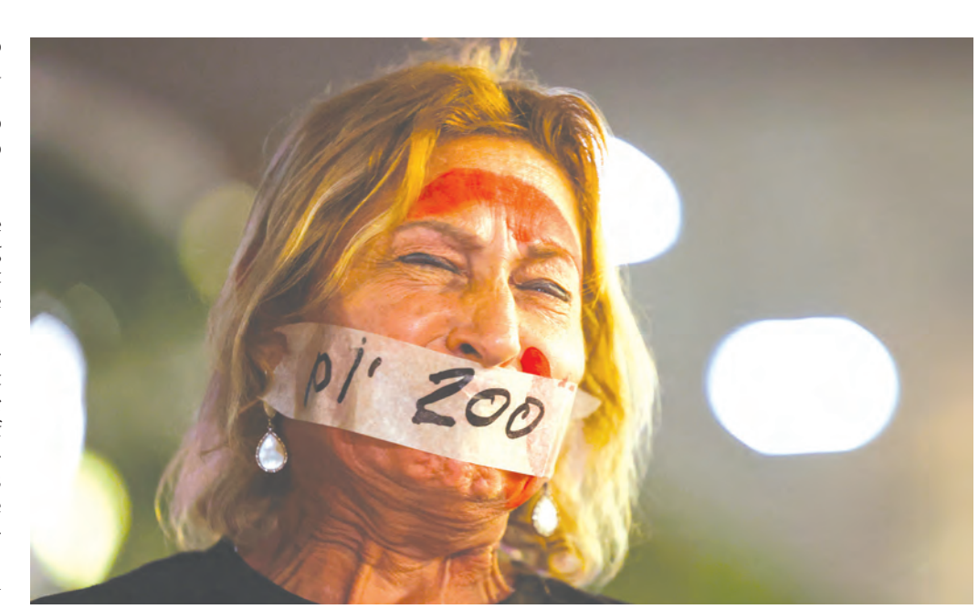
A WOMAN WITH her mouth sealed reacts during a protest marking 200 days since the start of the Gaza war, in Tel Aviv on Tuesday.