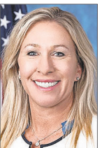
Rep. Marjorie Taylor Greene