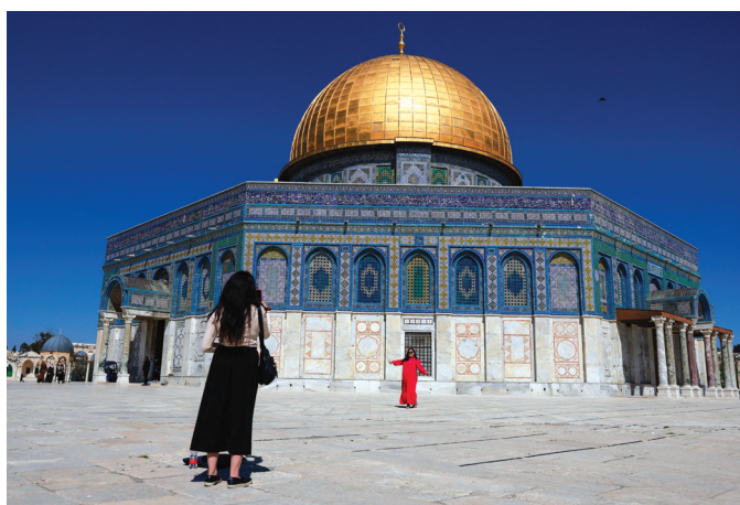
A TOURIST takes a photo in front of the Dome of the Rock on al-Aqsa's compound yesterday.

Ramadan is expected to begin on the eve of March 10. The meeting was headed by Prime Minister Benjamin